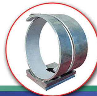
Spiral Duct Forming Heads

Plasma Torch Cut Off eliminates the need for costly slitting wheel sharpening, associated maintenance and ultimate replacement.